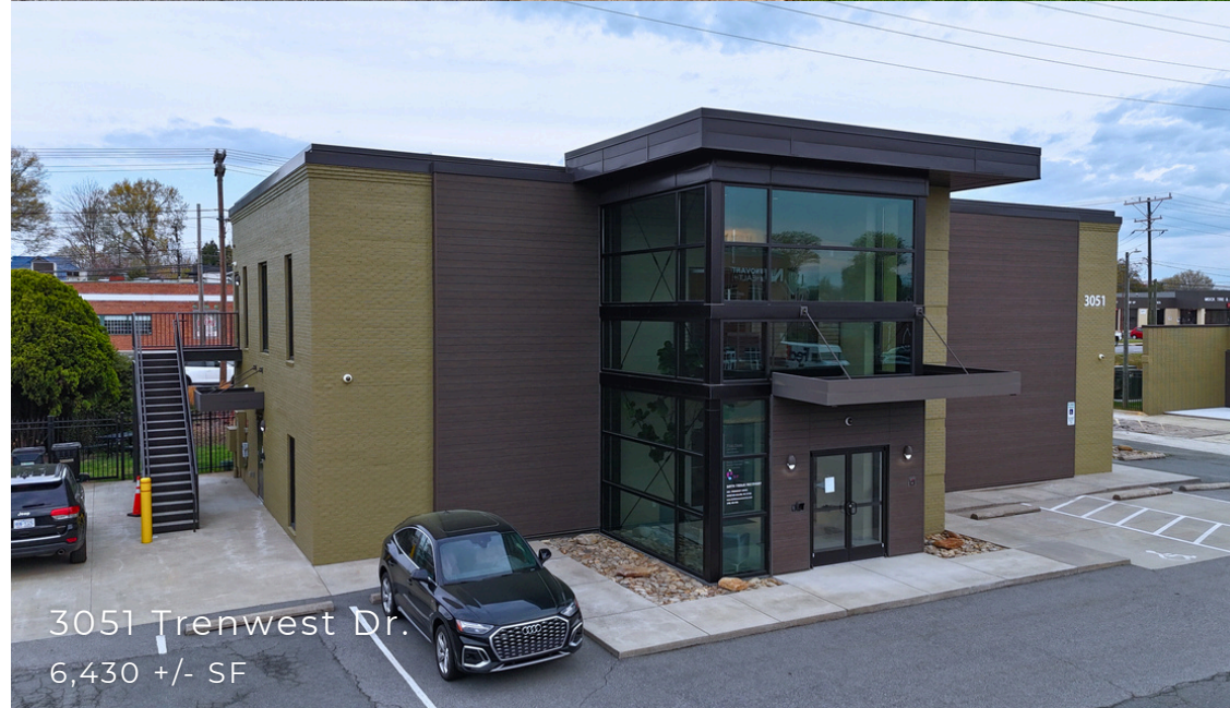
3051 Trenwest Dr. 6,430 +/- SF