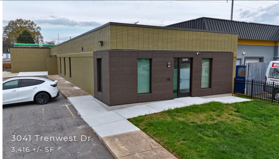
3041 Trenwest Dr. 3,416 +/- SF