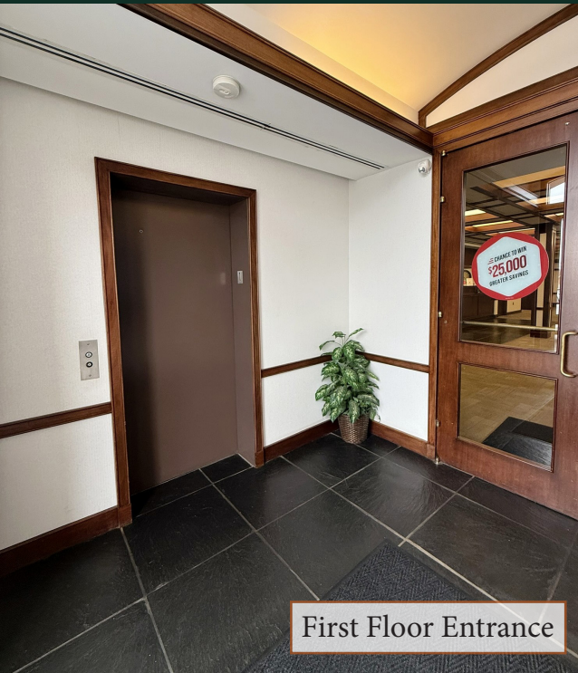
First Floor Entrance