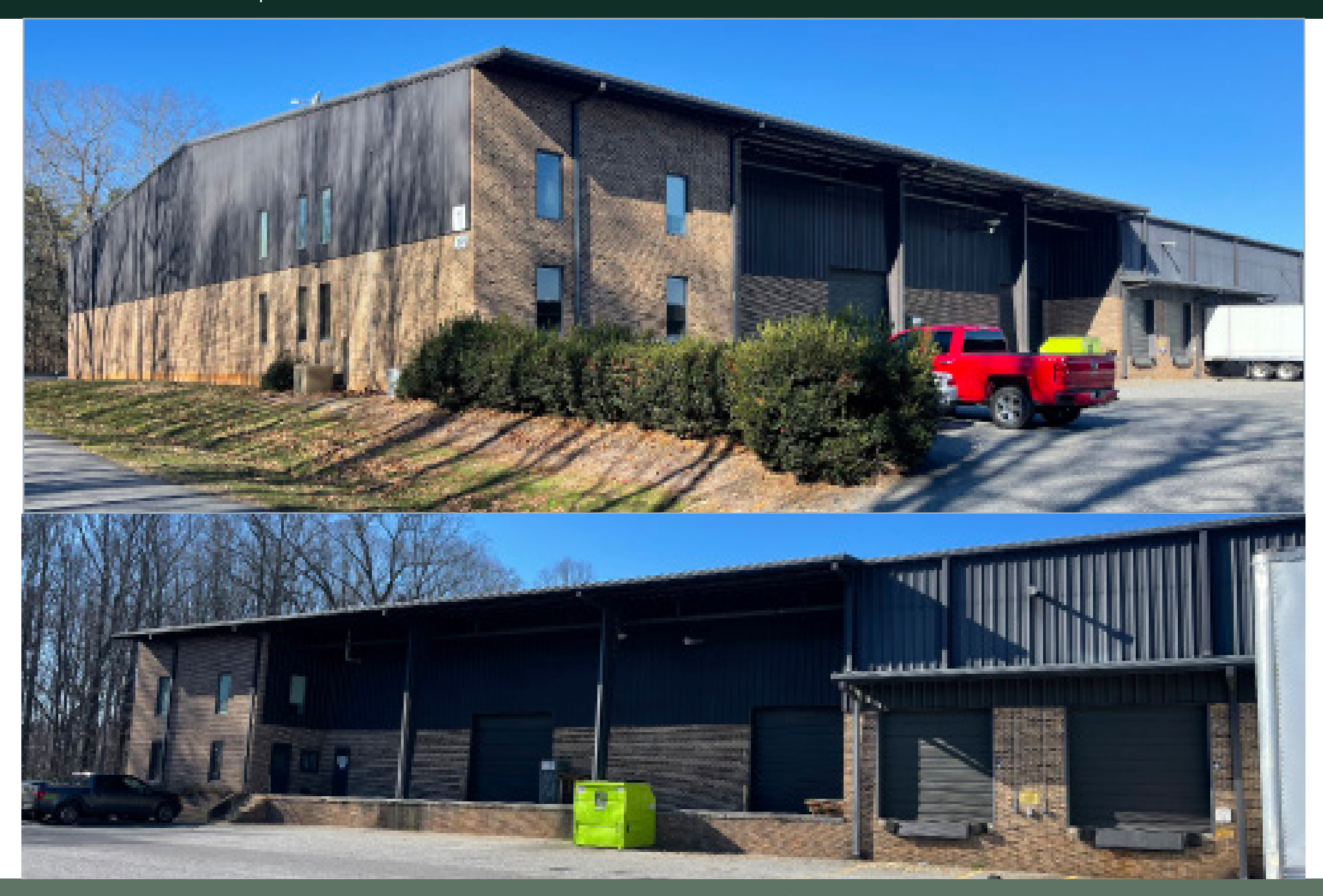
1255 CREEKSHIRE WAY SUITE 200 WINSTON-SALEM NC 27103 | WWW.FREEMANCOMMERCIAL.COM