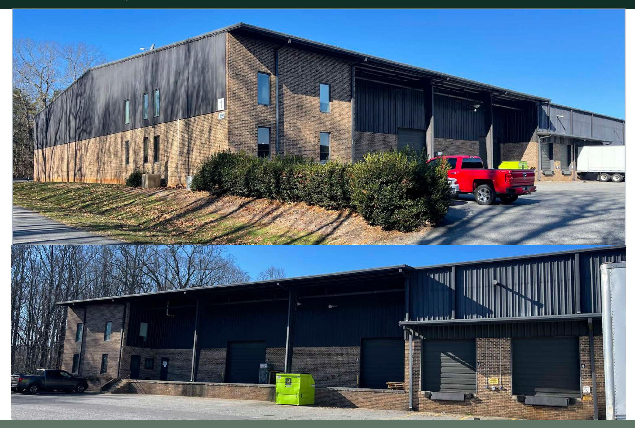
1255 CREEKSHIRE WAY SUITE 200 WINSTON-SALEM NC 27103 | WWW.FREEMANCOMMERCIAL.COM