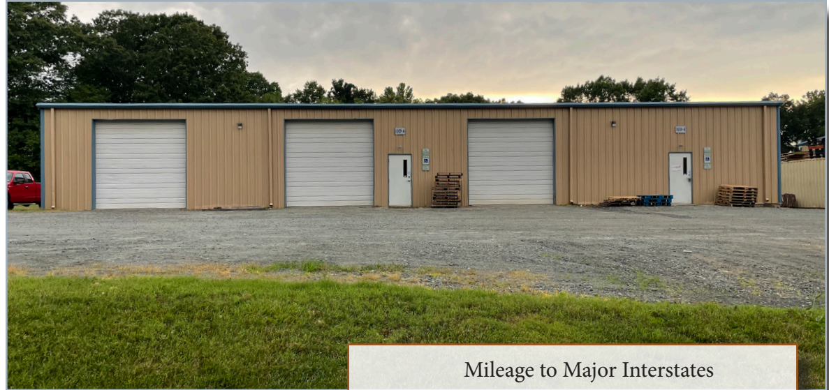
Mileage to Major Interstates