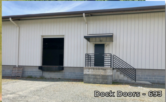
Dock Doors - 693