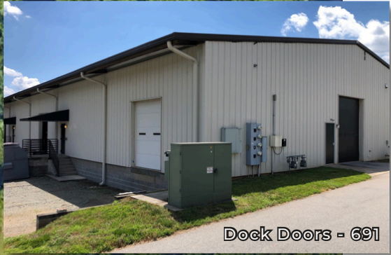
Dock Doors - 691